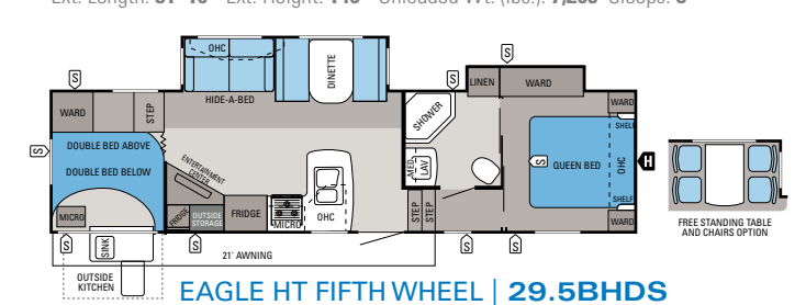
Ext. Length: 35' 1" Ext. Height: 149" Unloaded Wt. (lbs.): 7,980 Sleeps: 8-10

Ext. Length: 31' 10" Ext. Height: 146" Unloaded Wt. (lbs.): 7,205 Sleeps: 8